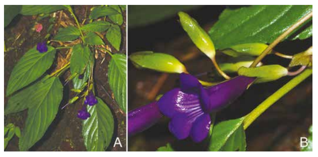
Fig. 2. Damrongia trisepala (Barnett) D.J.Middleton & A.Weber. A. Habit. B. Flower.